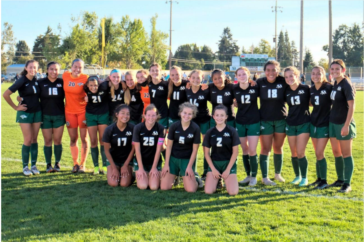
Image of the 2021 girls soccer team is courtesy of Jonathan Villagomez.